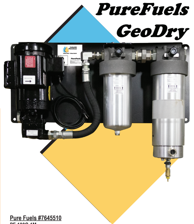
Pure Fuels #7645510 PF-100G-1M