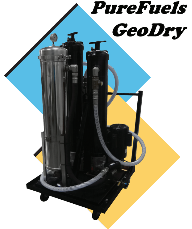
PureFuels Spare Element #7645513 PF-70G-3M